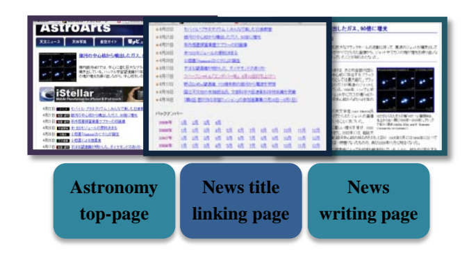
Fig. 1 Three kind of pages in astronomy websites

Since all three kinds of websites have functions for astronomy news, we include them in our research target and conduct a survey of their application modes. To precisely determine the news elements of astronomy websites, we categorize them into: (A) astronomy website top pages, (B) news title linking pages, and (C) news writing pages (Fig.1).