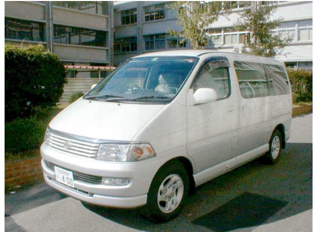
Figure 1: The exterior of Data Collection Vehicle

Human-machine speech interface in a car is an important application of spoken language systems because the conventional models of data input/output such as video display, keyboard and mouse are not convenient to use while driving a car. Development of an in-car speech interface has to deal with problems such as noise robustness and distortion of distant speech [1]. Since the background noise in a moving car is not stationary and consists of a variety of sounds, a large corpus is required for training acoustic models in the presence of different background noise conditions [2],[3]. Another important issue is that the in-car speech communication for information access by the driver has to deal with the continuously changing environment depending on the factors such as traffic condition and the distance to the destination[4]. For a system to understand the environmental condition, it may be helpful to use audio data along with other types of data such as video images of the persons involved in dialogue, images of the road in front of the car and vehicle related data such as the angle of the steering wheel, status of the accelerator and speed of the car.