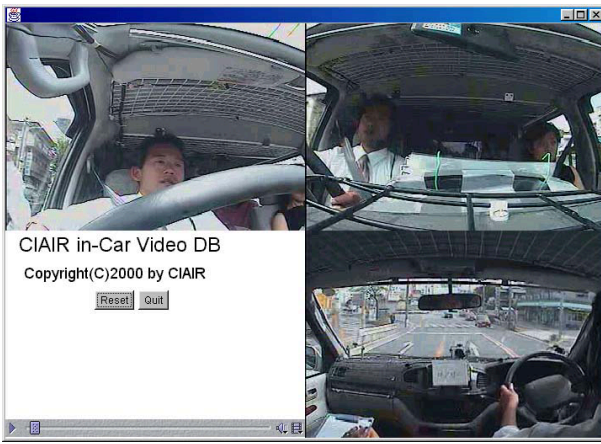
Figure 2: Multi-Angle Video Playback

for data collection. A prototype spoken dialogue system for guiding the car driver about finding a restaurant is described in Section 4.