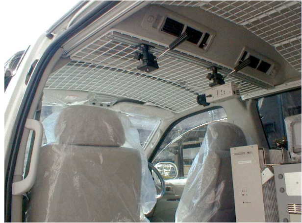
Figure 4: The interior of the DCV. Wire nets are attached for flexible arrangement of microphones.

ond camera captures the conversation between the driver and an accompanying person acting as a navigator. The third camera captures the images of the road from the front window of the car. These images are coded into the MPEG1 format. Figure ?? shows the synchronized playback of the multi-angle videos. The remaining two PCs are used for controlling the experiment. The multimedia data on all the systems is recorded synchronously. The total amount of the data is about 2 GB for about a 60-minute drive during which three sessions of dialogues are recorded. The recorded data is directly stored in the hard disks of the PCs in the car.