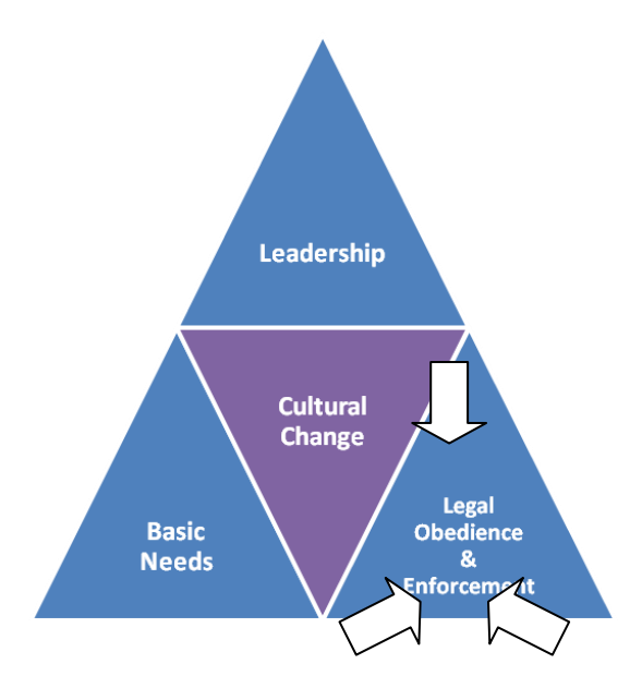
Figure 7.2 . Model of Cultural Reform Triangle (created by the author)

Leadership is a very essential factor to make government institution more dynamic. At least, there are two roles of leadership in ensuring the sustainable reform for the organization.