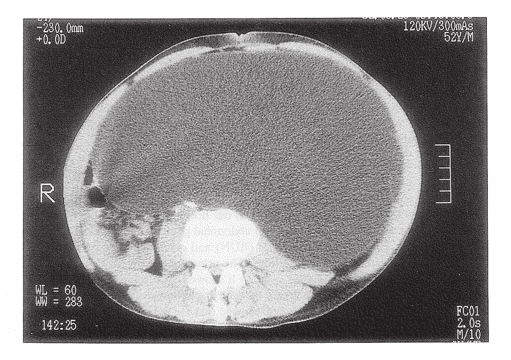
Fig. 1. CT scan shows giant hydronephrosis with the left hydronephrotic sac occupying the entire abdomen. Size and contour of the right kidney are normal.