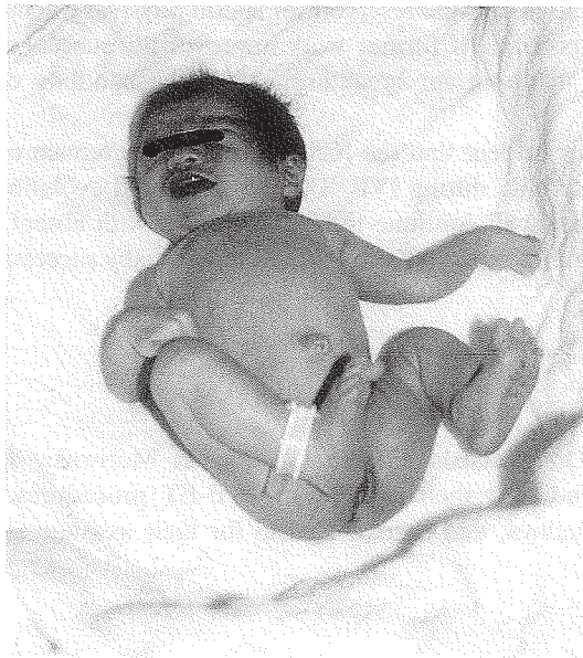
Fig. 2: Photograph of a female newborn (seven days after birth) originating from an oocyte treated by intracytoplasmic sperm injection with a testicular sperm.