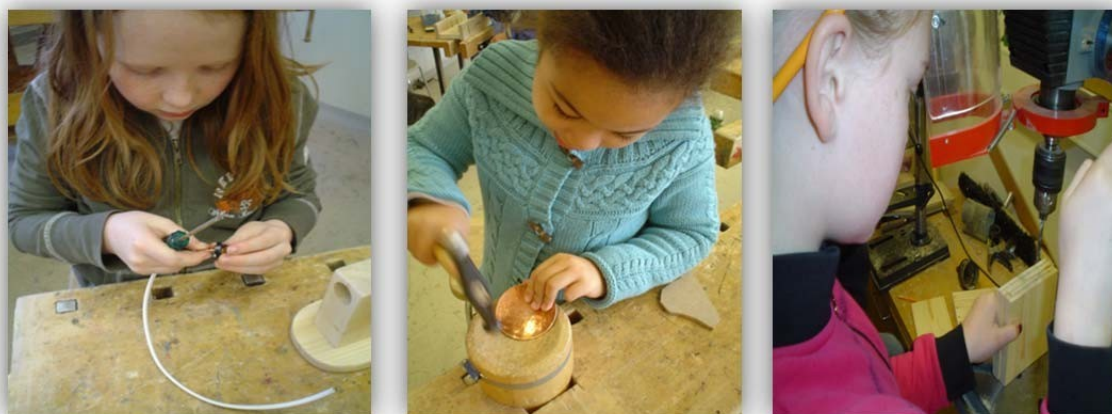
Figure 1: Young Icelandic students at work in the craft room

The subject of Craft was re-established as a new technological subject in 1999, under the name Design and Craft (Menntamálaráðuneytið, 1999). The new subject Design and Craft was based on a rationale for technological literacy, innovation and design. It became compulsory for grades 1–8, but optional for grades 9–10. The main aim was to develop technological literacy and idea generation skills in students (Thorsteinsson, 2002; Thorsteins- son & Denton, 2003; Olafsson & Thorsteinsson, 2009). The infrastructure (see figure 1) of Design and Craft was influenced by the national curriculum in New Zealand, Canada and England.