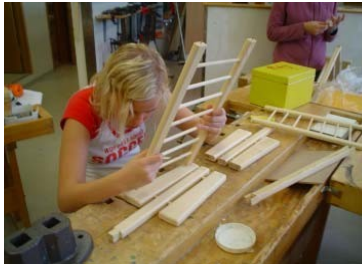
Figure 2: Young students at work in the classroom

The figure below shows the background of the Design and Craft subject. The emphasis was on technologically-based craft, focusing on design and innovation. These undertakings were expanded from an earlier curriculum with traditional aspects from technology education. It was also recommended to support the students' process of idea generation and the making of artefacts with relevant knowledge, for example, concerning sustainable design, the history of industry and health and safety.