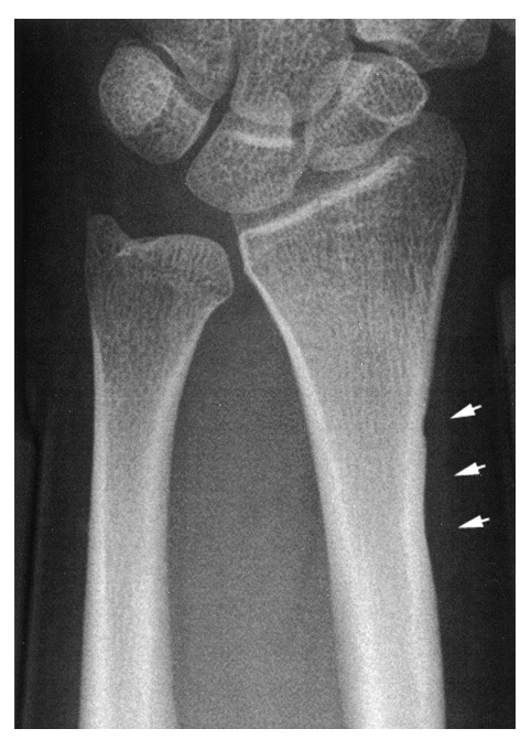
Fig. 1 Anteroposterior radiographs of the left wrist, showing slight cortical bone thinning (arrows) of the radial side of the distal radius metaphysis.

Surface-based bone hemangiomas are uncommon; there are approximately 30 previously reported cases, mostly occurring in long bones of the lower extremities<sup>1,2)</sup>. Bone hemangiomas are benign, malformed vascular lesions that account for less than 10% of all hemangiomas. Bone hemangiomas usually occur in the medullary cavity of the vertebral body and skull, accounting for 75%, and in the scapula, ribs, clavicle, and pelvic bones, accounting for an additional 15–20% of all cases<sup>4)</sup>. Since most of these lesions are asymptomatic, they are usually discovered