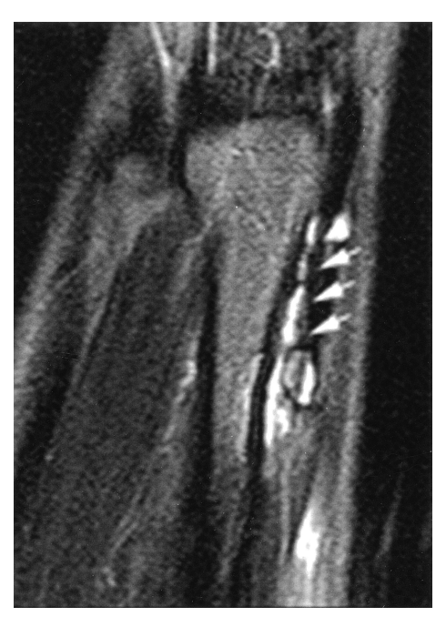
Fig. 2 Coronal T2-weighted magnetic resonance image of the left wrist, showing ambiguous lesions (arrows) with high signal intensity in the area of cortical thinning.