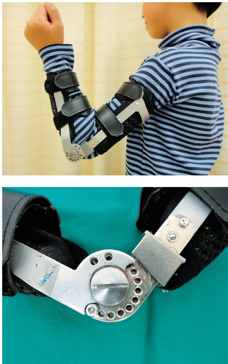
Fig. 4 Case 1, a 6-year-old boy. A) Photograph showing active range of motion exercises performed while wearing an adjustable hinged elbow splint that limits elbow extension. B) Photograph showing a hinge that can selectively control the range of elbow motion.

the control of the hinged splint. The patient was controlled to wear the splint all day for the first 4 weeks except bathing, and to hold the arm in 90 degree of flexion while bathing. Elbow extension reached full extension by 4 weeks after the commencement of exercise, then splinting was continued additional 2 weeks for prevention of elbow hyperextension. The splint was removed at 6 weeks. Plain radiography at 7 weeks after injury showed that the radial head was reduced in the full arc of pronation-supination motion. At 2 years and 3 months after injury, the patient had no pain and a full range of motion, and the radial head was reduced in all