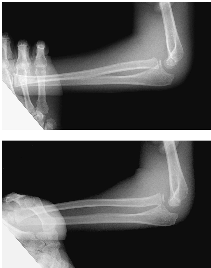
Fig. 3 Case 1, a 6-year-old boy. Lateral radiographs of the left forearm after closed reduction. A) The radial head was reduced in a supination position. B) The radial head was redislocated during rotation from neutral to a pronation position.

Restriction of elbow extension was gradually decreased, 10 degrees for every 3 days, under