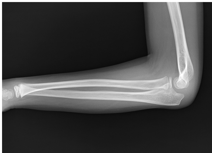
Fig. 5 Case 1, a 6-year-old boy. Lateral radiographs of the left forearm at 2 years and 3 months after injury, showing that the radial head was reduced in a pronation position.

positions on plain radiography (Fig. 5). The clinical outcome was excellent, as rated by Kim's elbow performance score 6 .