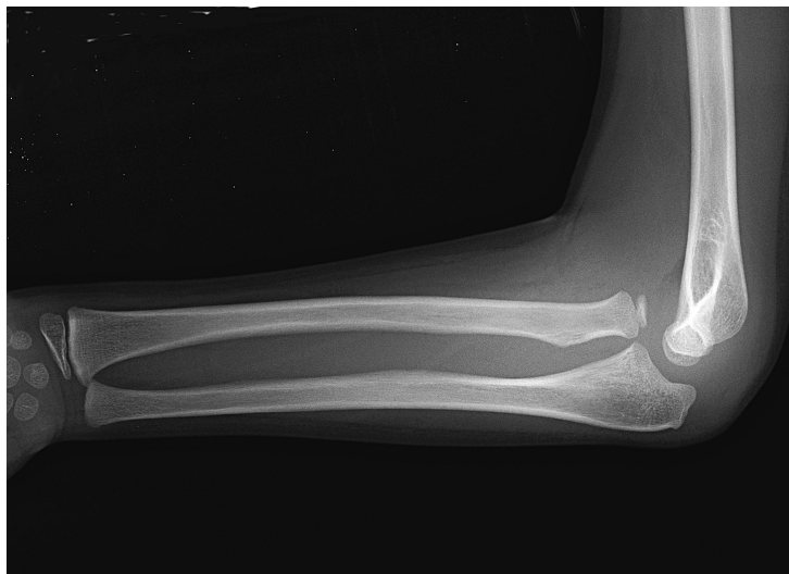
Fig. 1 Case 1, a 6-year-old boy. Lateral radiograph of the left forearm showing anterior dislocation of the radial head with plastic bowing of the ulna.

A 6-year-old boy was referred to our hospital due to incomplete reduction of the radial head. He had fallen down over an outstretched arm 8 days earlier. He had been diagnosed with radial head dislocation with plastic bowing of the ulna at a local hospital and reduction had been performed under general anesthesia on the same day. Plain radiography at the time of injury showed the radial head dislocated anteriorly and the ulna had a bowing deformity (Fig. 1). The ulnar bow rates 4) (the ratio of the maximum ulnar bow 5) divided by the ulnar length;