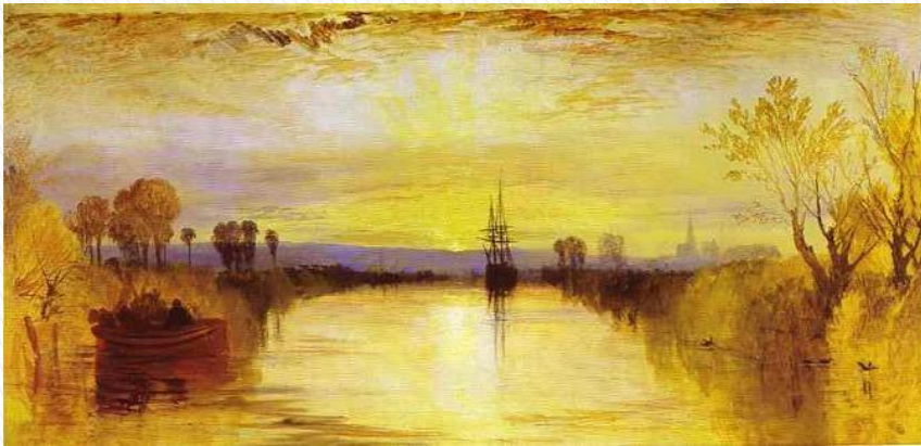
Turner 'Chichester Canal' (1828)