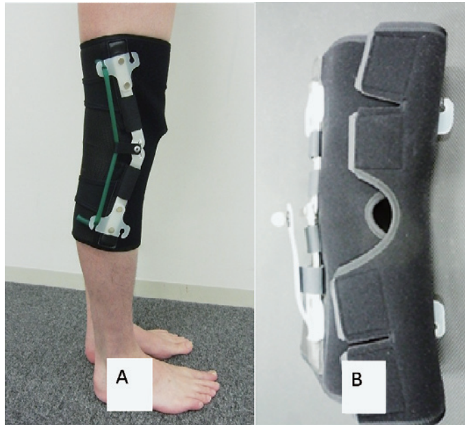
Fig. 1 (A) A custom-made hinged knee brace with flexion support (KBF). (B) Attachment for the knee joint marker.

tube strength (length) with 1 kg force for KBF in this study. The characteristics of the assistive knee flexion moment using the lateral and medial tubes were 0.44, 0.38, 0.32, 0.26, and 0.12 Nm, respectively, at 0, 15, 30, 45 and 60 degrees of knee flexion.