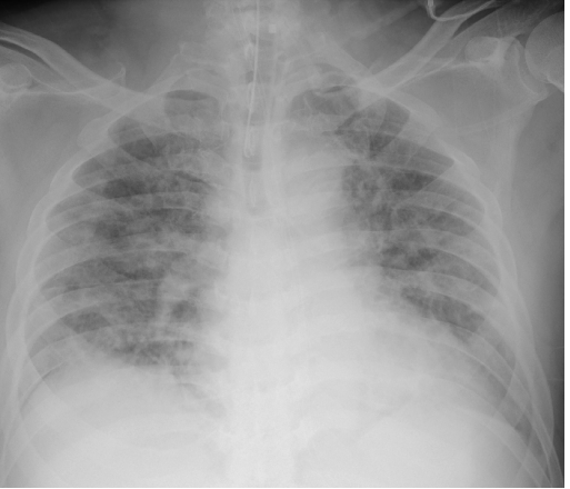
After tracheal Intubation