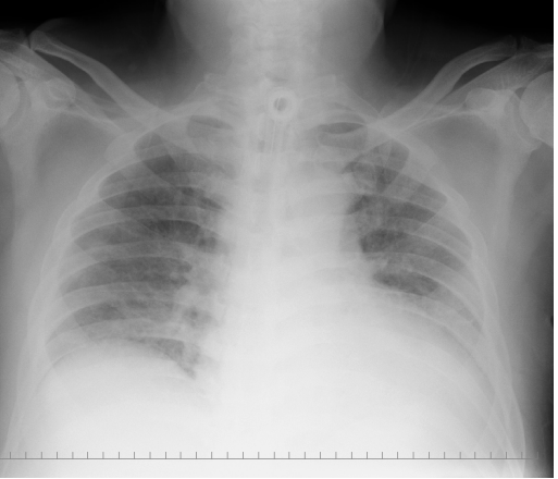
After leaving ICU