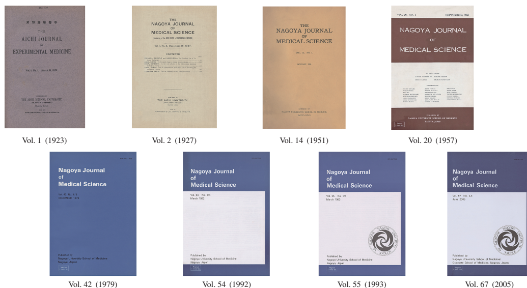
Fig. 1 All the covers of the Nagoya Journal of Medical Science

This journal was called as Aichi Journal of Experimental Medicine from 1923 to 1924.