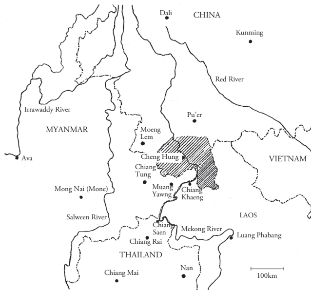
Fig. 1: Map around Sipsongpanna

The shaded area indicates present-day Xishuangbanna Dai Autonomous Prefecture