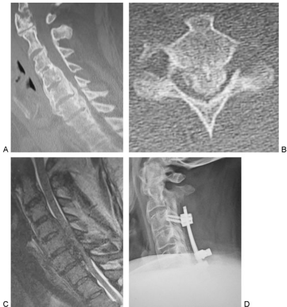
Fig. 2 Case 6. Sagittal (A) and axial (B) computed tomography shows diffuse idiopathic spinal hyperostosis (C2–C5, C7–T2) and mixed-type ossification of the posterior longitudinal ligament (C1–C2, C4–C7). Sagittal image on T2-weighted magnetic resonance imaging (C) shows severe cord compression. Postoperative plain lateral radiograph (D) shows postoperative posterior spinal instrumentation and fusion (C3–C7) with laminectomy (C2–C7).