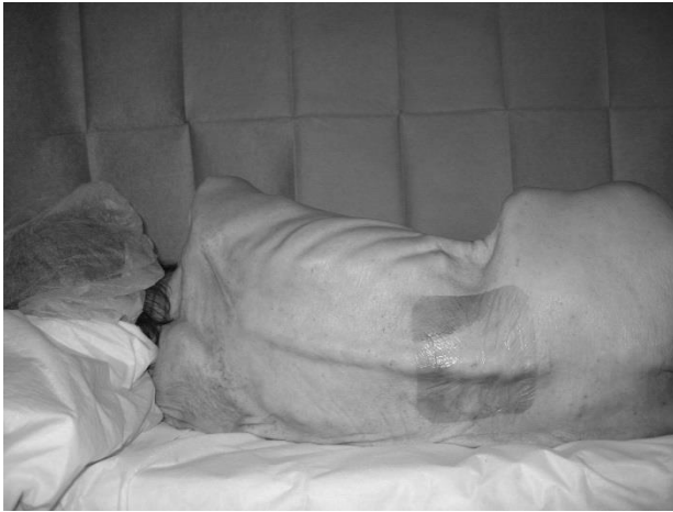
Figure 2. 80 year-old woman with a hip fracture lying on operation table. Coexisting severe sarcopenia was pointed out.

the risk of osteoporotic fracture is higher in elderly individuals with sarcopenia.