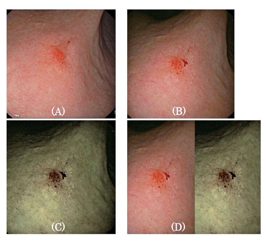
Fig. 1 Representative views on images of each endoscopy.

Representative views of early gastric cancer in a patient on images of (A) white light conventional endoscopy (W-CE), (B) white light ultrathin endoscopy (W-UE), (C) FICE ultrathin endoscopy (F-UE), and (D) white light plus FICE ultrathin endoscopy (WF-UE)