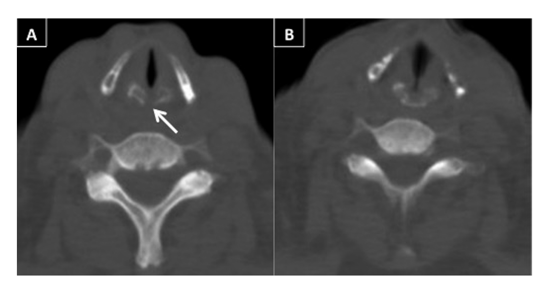
Fig. 2 Neck CT